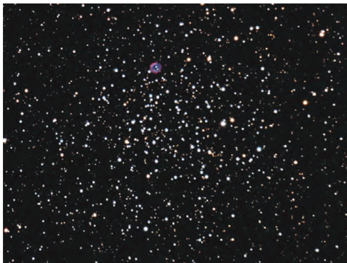
The author took this image of M46 with an SBIG ST-2000XCM CCD camera with a 20-inch f/8 Ritchey-Chrétien Cassegrain telescope.